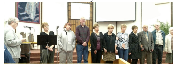
The Deacons as they were confirmed.