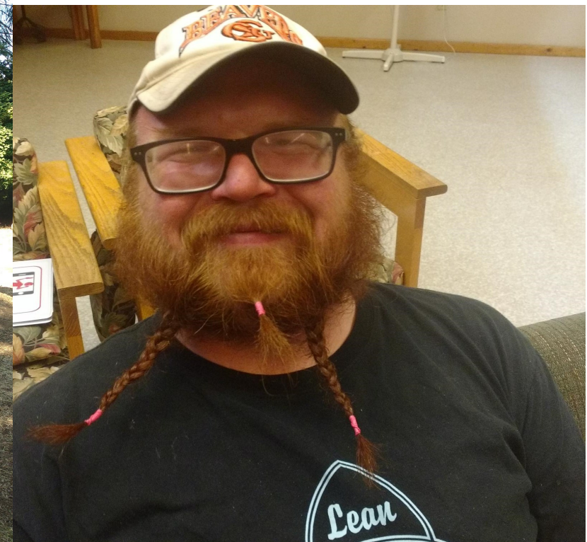
The catastrophe of trying to braid Pastor's beard